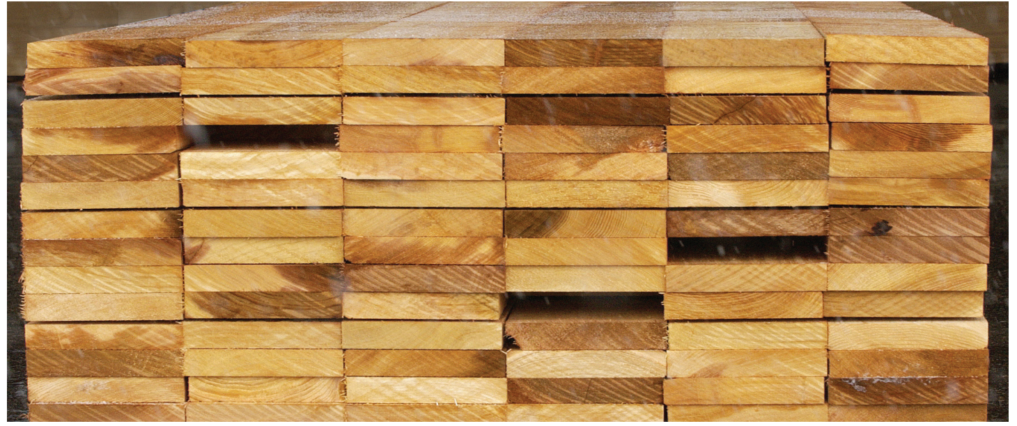
Issued June 2016 Validity extended until December 2024

This Type III environmental declaration is developed according to ISO 21930 and 14025 for average cedar lumber manufactured by the members of the Western Red Cedar Lumber Association. This environmental product declaration (EPD) reports environmental impacts based on established life cycle impact assessment (LCIA) methods. The reported environmental impacts are estimates, and their level of accuracy may differ for a particular product line and reported impact. LCAs do not generally address site-specific environmental issues of related to resource extraction or toxic effects of products on human health of product systems. Unreported environmental impacts include (but are not limited to) factors attributable to human health, land use change and habitat destruction. Forest certification systems and government regulations address some of these issues. The products in this EPD conform to: regulations of BC and forest certification schemes (Canadian Standard Association, Sustainable Forestry initiative (SFI), and Forest Stewardship Council (FSC)). EPDs do not report product environmental performance against any benchmark.